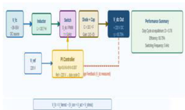
Figure 3: DC-DC Boost Converter with PI Closed-Loop Control – Inductance, Switching, and Feedback Path

The fuel cell's variable, low-magnitude DC output (typically 20–60 V under load) cannot directly drive a grid-tied inverter, which requires a stable, elevated DC bus voltage. The DC-DC boost converter performs this voltage conditioning role. Its gain is given by 1/(1-D) , where D is the duty cycle; at D = 0.76 , the converter achieves a nominal gain of approximately 4.17, stepping up a 55 V fuel cell voltage to the required 220 V DC bus [